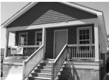
The Thrivent builds home.

Outside the physically intensive days spent working on the house, the evenings were filled with touring the still-devastated areas of New Orleans and experiencing the southern culture. An avid Packer fan, she also led a group tour to Kiln, Mississippi to visit the hometown of her favorite Packer, Brett Favre—a tour she has enjoyed on previous trips to