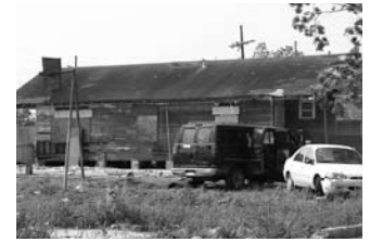
A home near the Thrivent build site.

Her advice to other SMC alumni: "If you get the chance, please sign up to volunteer. The experience was incredible, emotional and life altering." You can find more information about the Thrivent Builds at thriventbuilds.com . To contact Diane, please send a message to alumni@tcces.k12.wi.us .