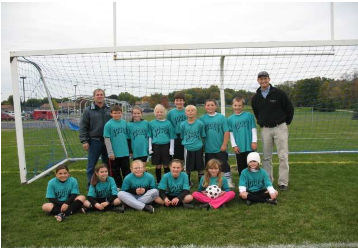
The end of the season for our combined 5 th and 6 th grade TCCES Soccer Team.

The 3rd/4th grade Saturday Morning Basketball Skills Program begins this Saturday, November 7th at St. Margaret Mary School and runs from 8:30-10:00 a.m. If your child is interested in joining please return the sign-up form to school as soon as possible. Additional sign-up forms will be available Saturday morning at St. Margaret Mary.